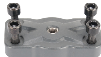
AV2RSB Rear Support Bracket