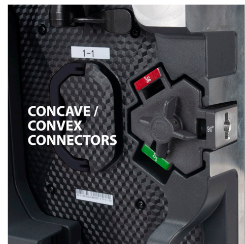
CONCAVE / CONVEX CONNECTORS