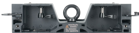
AV2RB Rigging Bar